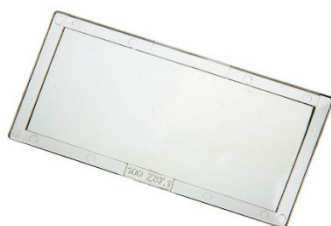
Magnifying Diopter Lens