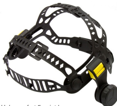
Halo comfort 5 point harness (Front view)