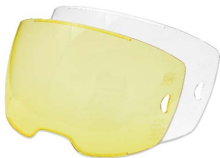
HD Front Cover Lens