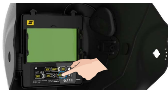
High optical class ADF, with colour touch screen interface